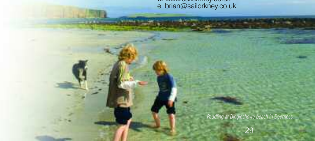
Paddling at Dingieshowe beach in Deerness.