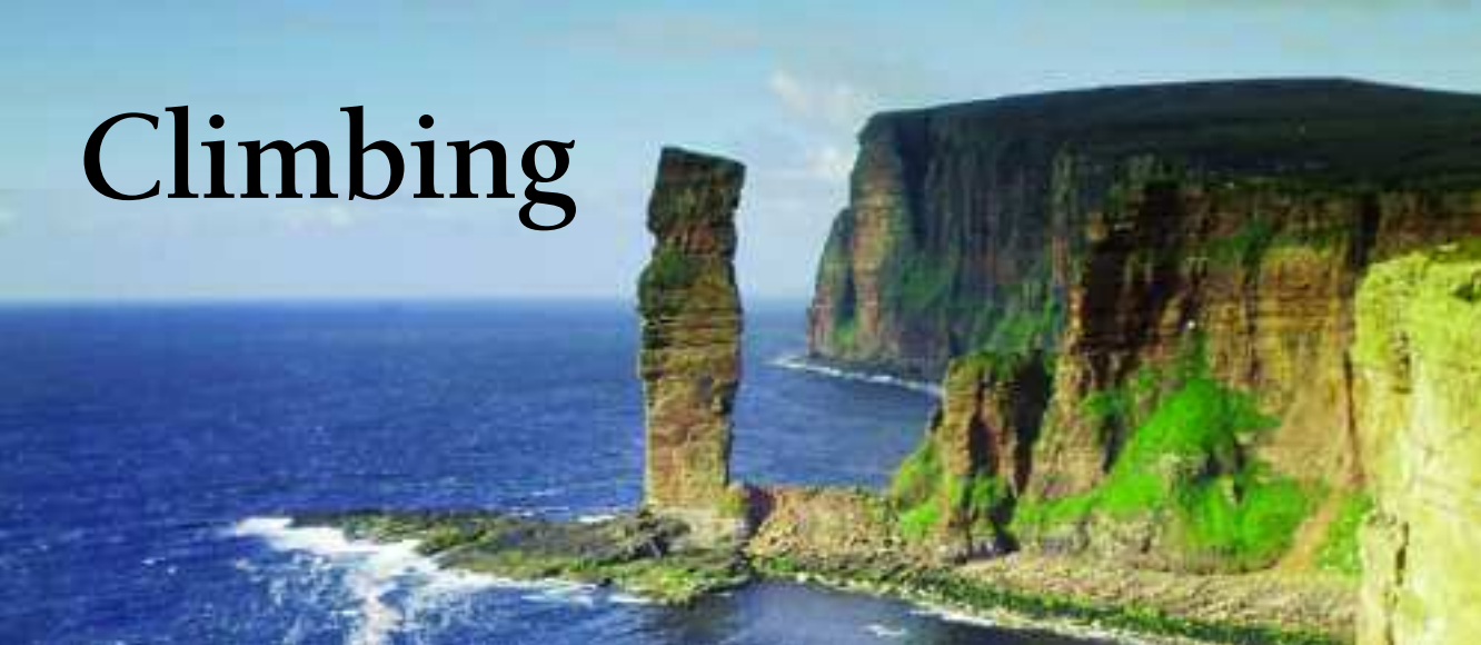
The Old Man of Hoy with St John's Head in the background.

Rock climbing in Orkney is not for the faint-hearted or inexperienced climber. Routes consist mainly of coastal sandstone rock and cliff routes, on crumbling or weed-covered stone. Mainly known to climbers for its majestic sea stacks, Orkney is in fact virgin territory for rock climbing, providing great potential for new routes.