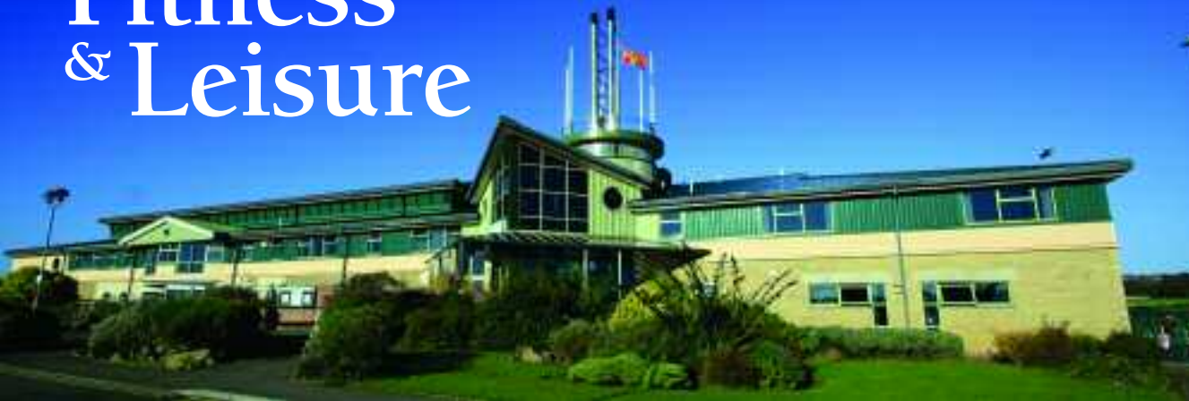
The Pickaquooy Centre.

Keeping fit and healthy in Orkney is an easy task, with so many fantastic facilities at hand. In 1999, an all-purpose, state-of-the-art leisure centre was built in Kirkwall, and it has become the hub of the area's thriving fitness and leisure scene.