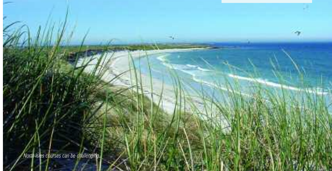
North Isles courses can be challenging.

It's fair to describe these events as more of a social occasion than a serious golfing event, but what better excuse do you need than to join in on this unusual activity?