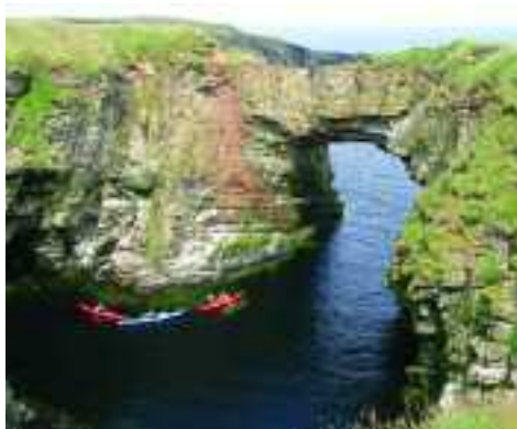
The Vat of Kirbuster on Stronsay.

The beauty of paddling amongst the many islands and spending time on the ocean is that you can do things at your own pace. The choice is yours, whether it be an overnight camp on a remote beach, a chat with a friendly islander, a close-up encounter with an otter or just choosing to head for the watery horizon to search out the peace and tranquillity of being in one of the most beautiful and atmospheric sea kayaking locations in the world.