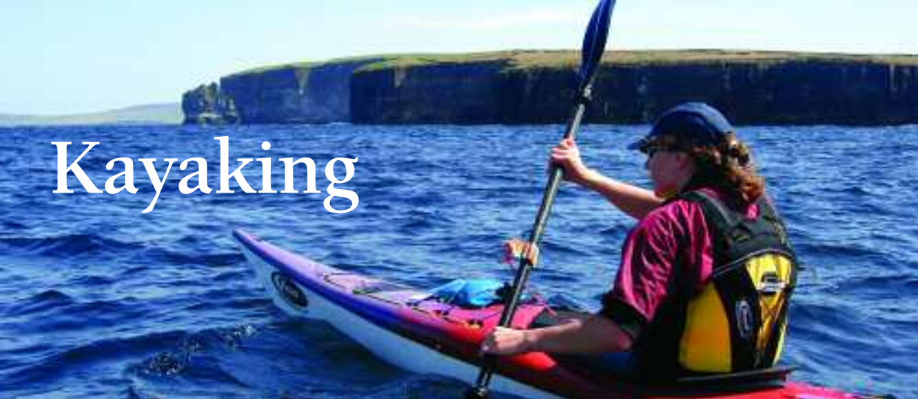
Exploring the spectacular and varied coastline of the north isles.

Whether it be tackling the swirling and chaotic tidal streams within the Pentland Firth or gently gliding through glass-like waters beneath a sheltered cliff-line, the experiences and memories of paddling in Orkney will ensure you find an excuse to return time and time again.