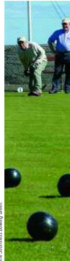
The Stromness Bowling Green.

There are three outdoor bowling greens. These are open during the summer only and can be found in Kirkwall, Stromness and St Margaret's Hope.