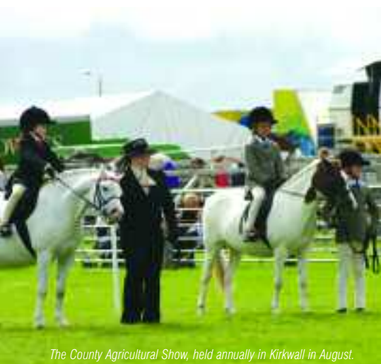
The County Agricultural Show, held annually in Kirkwall in August.