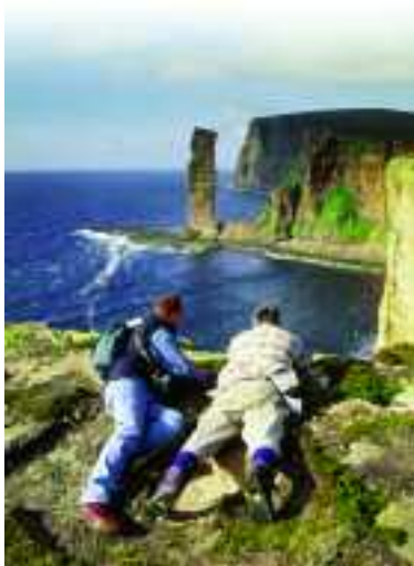
The Old Man of Hoy.

You will find that there is something to do around every corner in Orkney, and you may find yourself spoilt for choice! See page 3 for contact details.