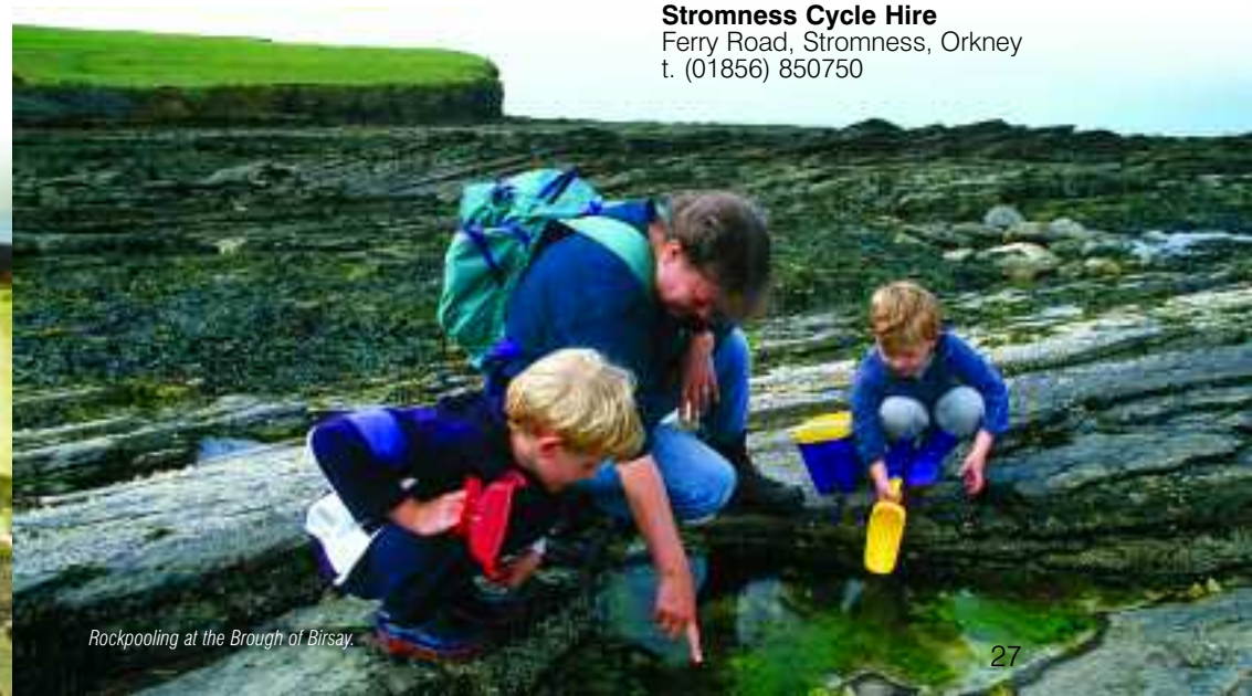
Rockpooling at the Brough of Birsay.

Ferry Road, Stromness, Orkney t. (01856) 850750