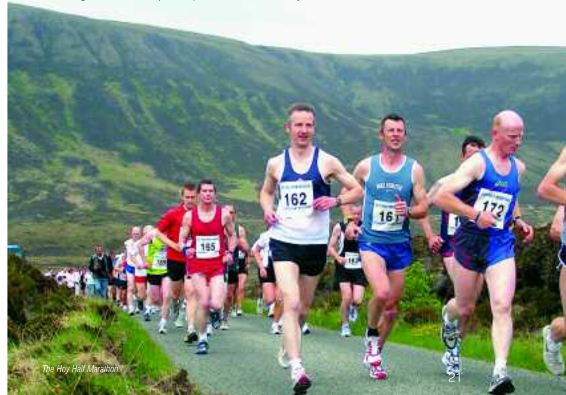
The Hoy Half Marathon.

Scotland's most scenic and friendly half-marathon takes place on the island of Hoy every June. Various age categories, including veterans, take part and there are children's events for those aged 5-17. Transport is provided from Orkney Mainland.