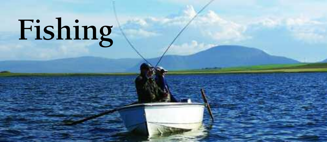
Casting a line on Harray Loch.