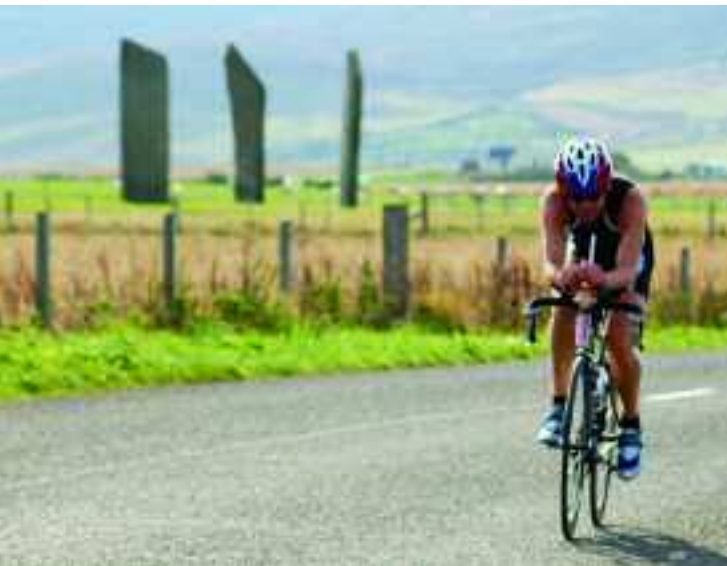
Cycling past the Standing Stones of Stenness.

The swim, which is 1.9km, starts at Scapa Beach near the main town of Kirkwall and is a two loop triangular course. As the water temperature would be expected to be between 14 and 16°C, wetsuits are mandatory and neoprene caps are heartily recommended.