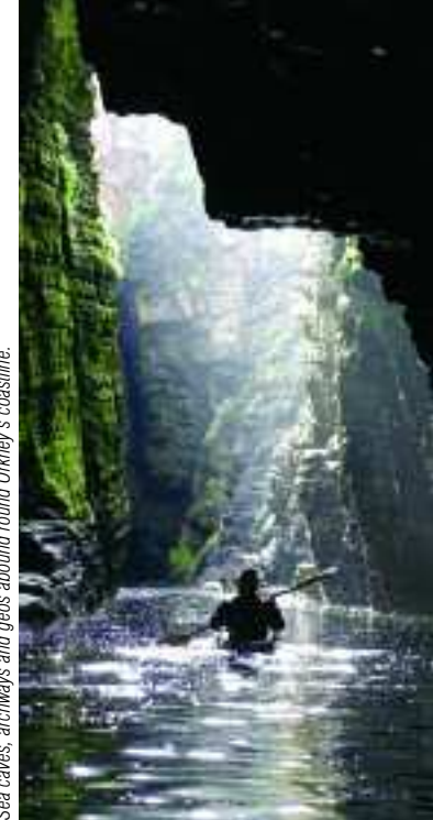
Sea caves, archways and geos around round Orkney's coastline.

It is imperative that wherever you choose to explore, you should check an up-to-date local weather forecast and tide tables to ensure the weather and water conditions are within your ability. Having a good knowledge of tidal movements that may affect your journey and prior experience of being in choppy or unpredictable seas will enhance your enjoyment of seeking out the many adventures on offer around the unspoilt and rugged coastlines.