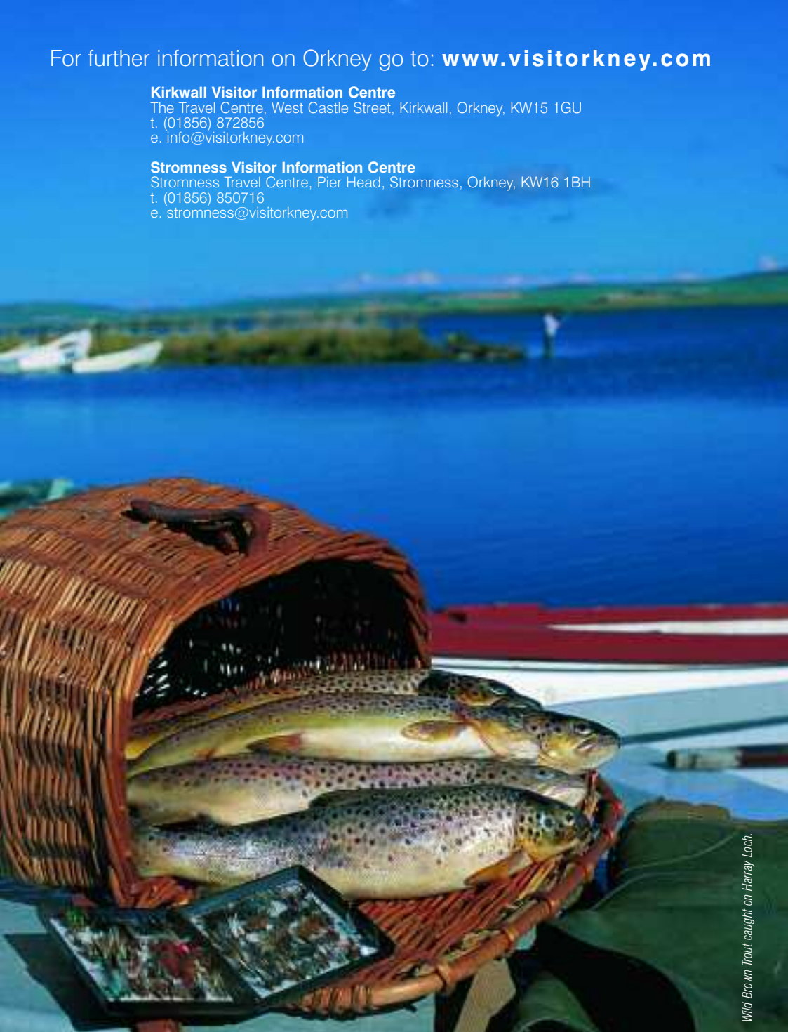
Wild Brown Trout caught on Harra Loch.

Stromness Travel Centre, Pier Head, Stromness, Orkney, KW16 1BH t. (01856) 850716 e. stromness@visitorkney.com