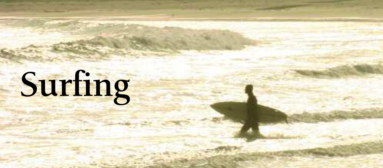
The Bu Sands in Burray.

Orkney's fantastic surfing potential has been a well-kept secret by many boarders, keen to keep it to themselves.