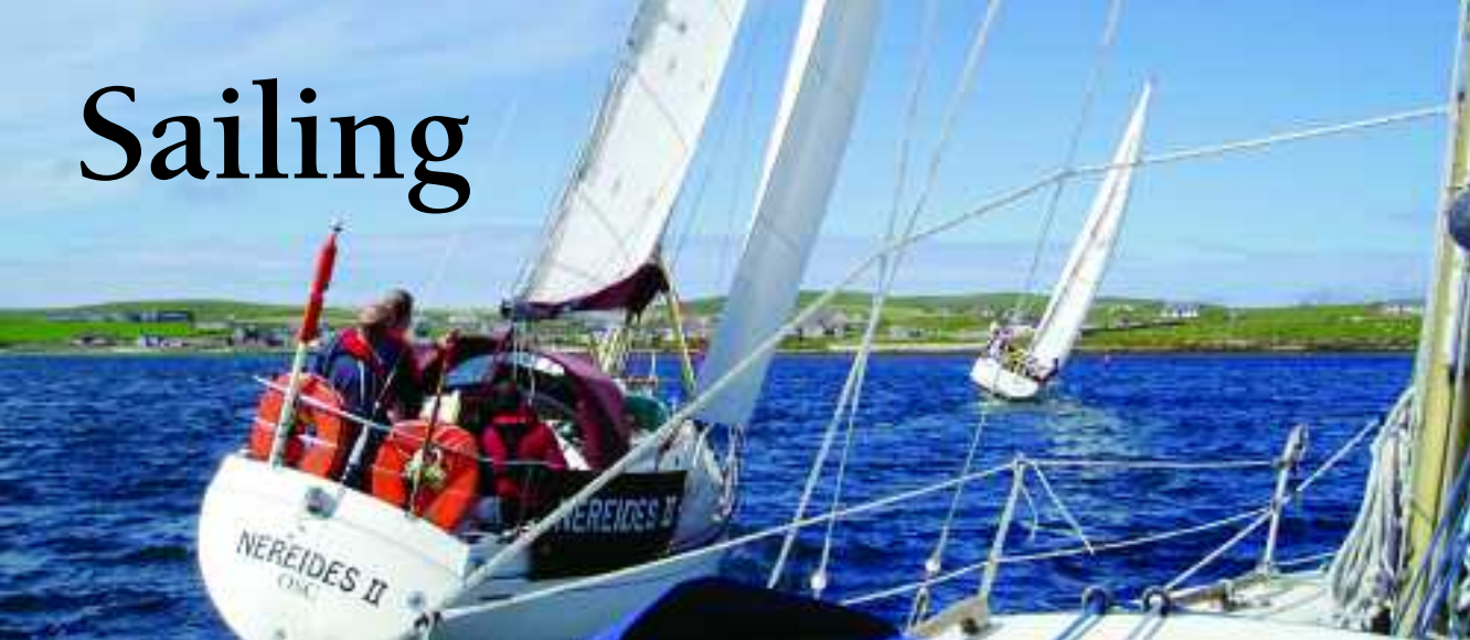
Sailing regatta in Westray.

The waters around the Orkney Isles have been attracting yachtsmen and women from as far afield as Norway and Brittany for many years, drawn by the spectacular coastline, the many sheltered anchorages, and the traditional hospitality in Orkney's delightful harbours.