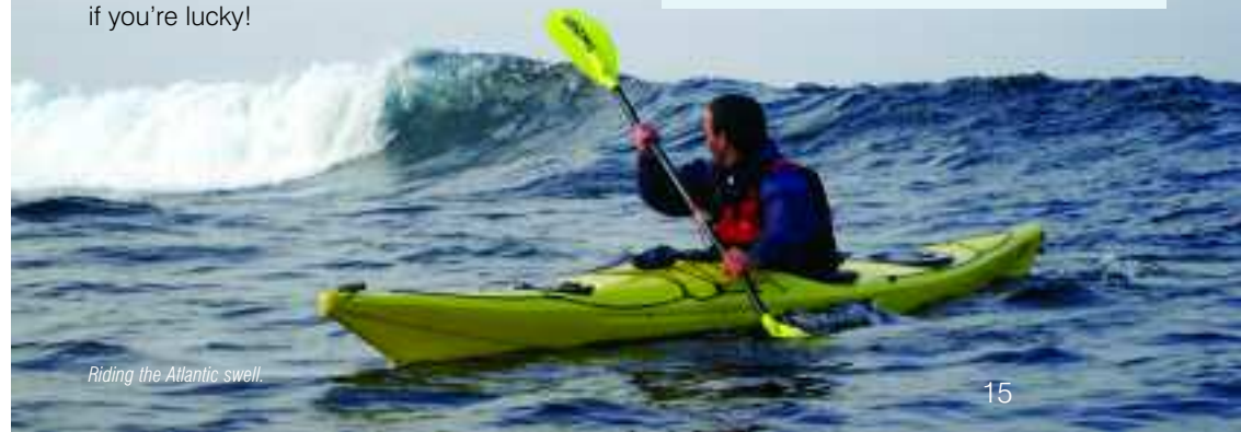
Riding the Atlantic swell.

It is imperative that wherever you choose to explore, you should check an up-to-date local weather forecast and tide tables to ensure the weather and water conditions are within your ability. Having a good knowledge of tidal movements that may affect your journey and prior experience of being in choppy or unpredictable seas will enhance your enjoyment of seeking out the many adventures on offer around the unspoilt and rugged coastlines.