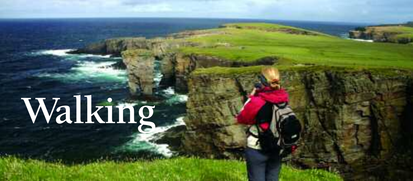
The Castle of Yesnaby.

Walking is one of the best ways to experience Orkney, by combining the pleasures of the senses, and an intimacy with the environment which many visitors find so fulfilling. Whether you enjoy walking as a break from sightseeing or like to make it the main focus of your holiday, you'll find plenty of choice in Orkney.