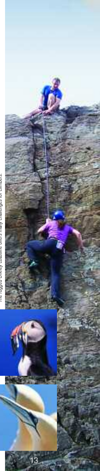
The rugged Orkney coastline offers many challenges for climbers.

Lastly, it is imperative that the appropriate safety procedures and precautions are followed while rock climbing in Orkney, due to the nature of the rock.