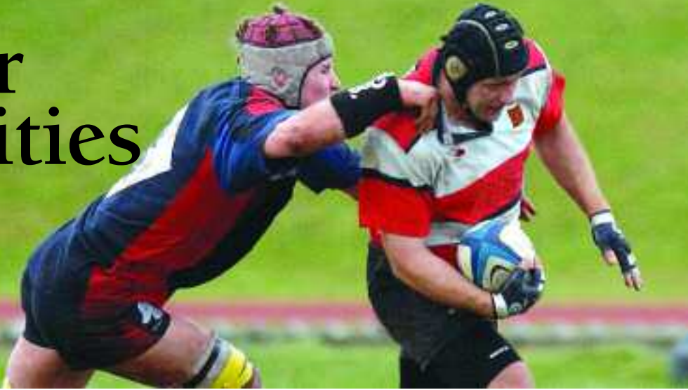
Orkney has a strong rugby team and compete in the National Division 5 Caledonia A League.