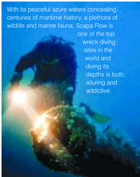
Exploring the remains of the German High Seas Fleet, scuttled in Scapa Flow.

one of the top wreck diving sites in the world and diving its depths is both alluring and addictive.