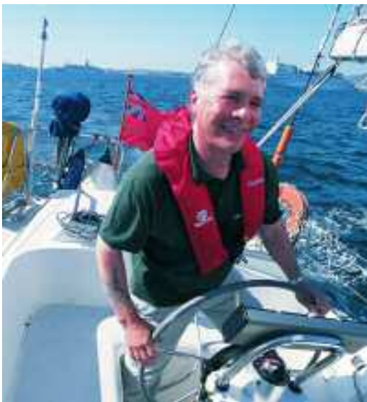
Sailing in Kirkwall Bay.

In July each year, the popular Orkney Challenge Yacht Race from Lossiemouth to Kirkwall takes place, which brings a friendly throng to the harbours. Old friends meet up and newcomers become old friends.