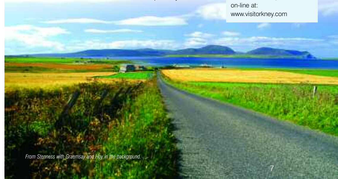
From Stenness with Graemsay and Hoy in the background.

VisitScotland 'Cyclists Welcome' scheme. They provide additional services to cyclists such as lockable covered sheds for bikes, clothes drying facilities etc. Look out for these providers in the VisitOrkney brochure or on-line at: www.visitorkney.com