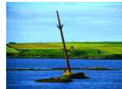
Remains of 'blockships' at the Churchill Barriers.

The visibility experienced in Orkney waters is usually 10 metres but can be as good as 15-20metres.