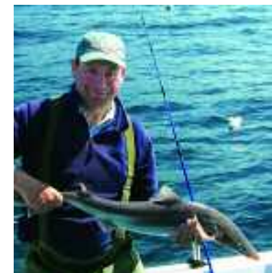
Many species can be found in Orkney waters.

Please take care when fishing from rock marks in Orkney as the swell and tides can be unpredictable.