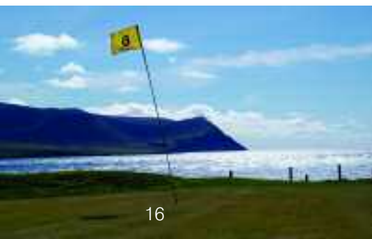
Stromness golf course offers spectacular views.

The courses are charming and cheerful places to play and socialise, with a turn-up-and-play policy (exceptions to this are competition times and special event days). However, at all courses, visitors are welcome to enter the Open events held throughout the season.