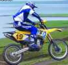
The Orkney Motocross Club track at Hill of Heddle, Finstown.