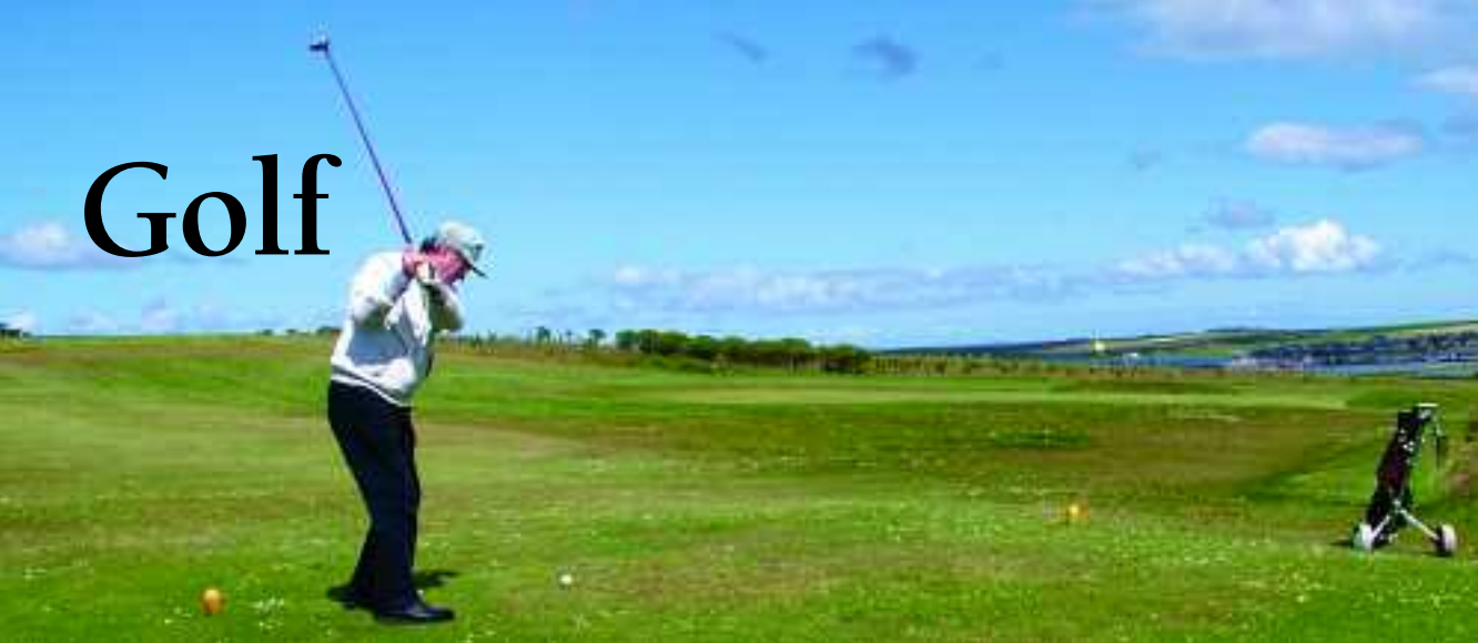
Kirkwall golf course.

Whether your handicap is five or 35, Orkney's golf courses will test your golfing ability, and if the golf is not up to scratch, then the views and hospitality definitely will be!