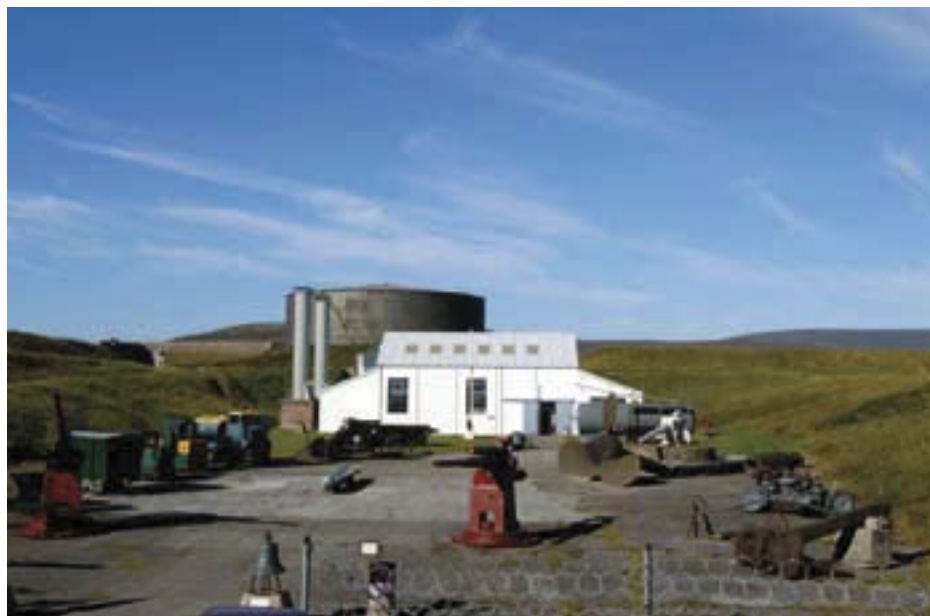
visitor centre outdoor display

Hoy's major contribution to Orkney's heritage came in the 20th century when in 1914 Scapa Flow became the base of the Royal Navy's Grand Fleet. which sailed and engaged the German High Seas Fleet at the Battle of Jutland on 31 May, 1916. The captured German fleet was interned in Scapa Flow and subsequently scuttled on 21 June 1919. During World War II thousands of navy personnel were based at Lyness and the now deserted naval base has been converted to a visitor centre with many exhibits from both world wars and the scuttled German fleet. In addition there is an audio visual display within the remaining giant oil tank.