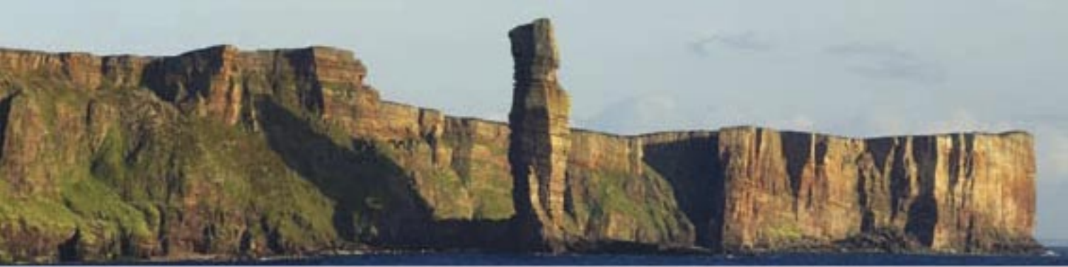
west face of hoy - drew kennedy

8 Hoy High & Hoy Low Lighthouses, Graemsay: Completed in 1851 Hoy High's white 108-foot tower tapers to a balcony supported by Gothic arches. At the foot of the tower are keepers' houses, built in a style reminiscent of Assyrian temples.