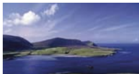
burra sound to hoy - charles tait

St Columba's, Longhope – Church of Scotland. All denominations welcome. Services advertised locally.