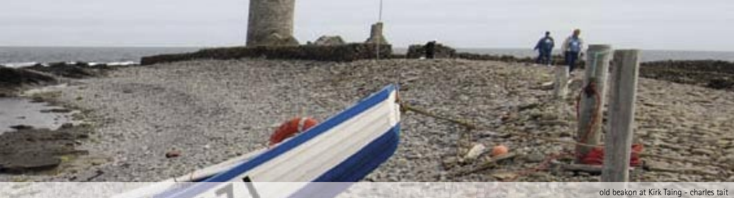
old beakon at Kirk Taing