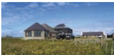
bird observatory

Before the trawlers came, good hauls of cod, ling and halibut were caught off the shores of North Ronaldsay. In the Firth, saithe were frequently taken though this posed many dangers as the fish were found where tides ran strongest. Lobster and herring were also caught but today there is less fishing from the island.