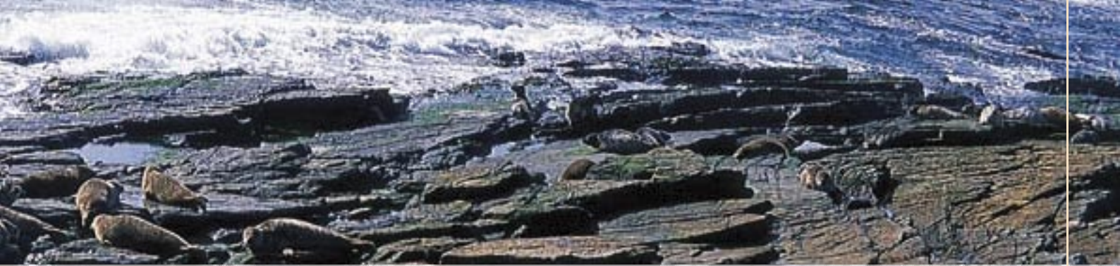
seals, north ronaldsay - moya mckenzie mcdonald