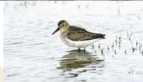
knot - charles tait