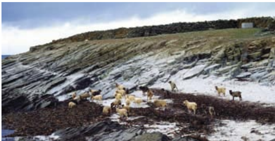
north ronaldsay sheep - charles tait

There is little evidence of the true origin of North Ronaldsay's seaweed-eating sheep. They live on a narrow strip of beach and foreshore outside the 13-mile stone dyke which surrounds the island, being brought inside the wall only at lambing. When the clipping and dipping seasons arrive the sheep are herded off the beaches into the stone-built 'Punds' by the collective efforts of the island's sheep farmers. The act of punding is perhaps one of the last remaining elements of communal farming in Orkney.