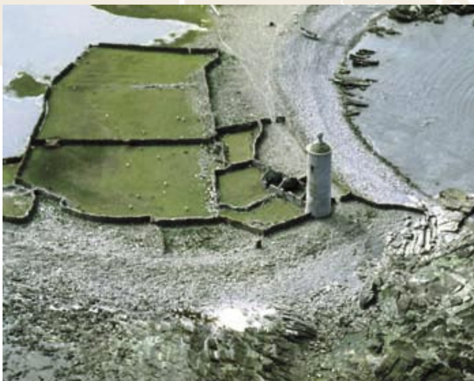
old beacon, dennis taing - charles tait

Inland the island can broadly be divided into four distinct habitat types: foreshore, grazed links, marshland and agricultural land which together provide a wealth of opportunities for wildlife.