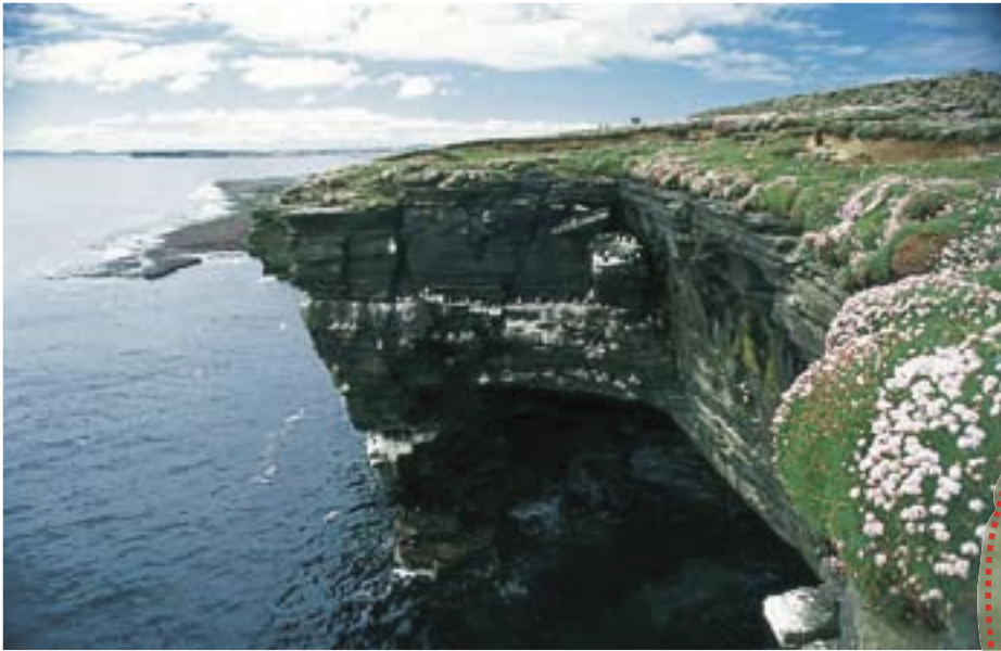
fowl craig - charles tait