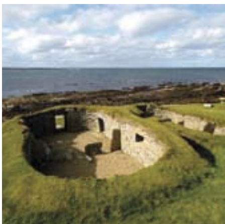
knap of howar - charles tait

Viking sites are less easily identifiable but the Scandinavian links can be traced, as elsewhere, through the farm names. Only in 1472 did Papay along with the rest of Orkney become part of Scotland – pledged as a royal marriage dowry. There are interesting burial sites, including the impressive chambered cairn on the Holm, a lonely, atmospheric place.