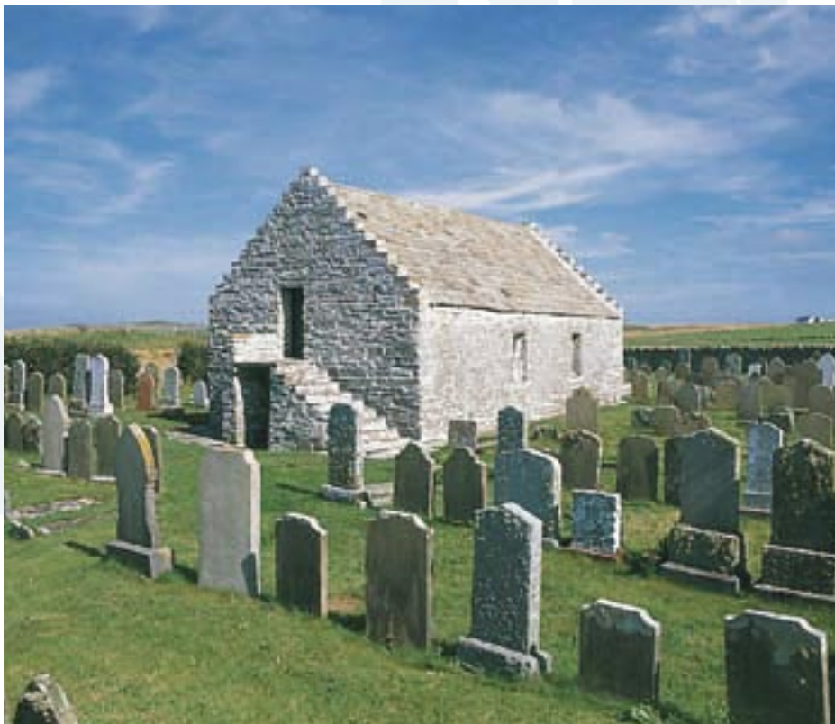
st boniface kirk - charles tait

One of the farm workers' bothies has been converted into a compact museum displaying a fascinating range of artifacts from the island's history including the parish handcuffs!