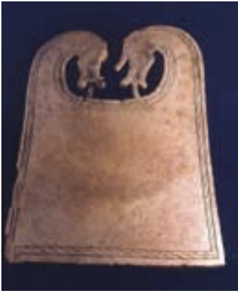
scar plaque - orkney museums and archive