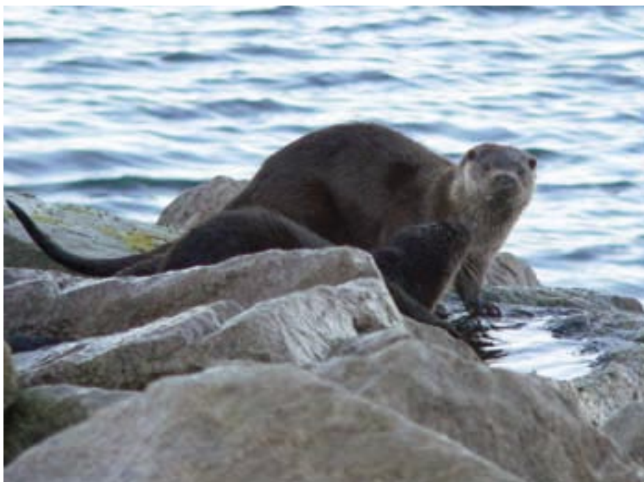
otters - roderick thorne

Sunday Arts Festival - Sept. See local notices.