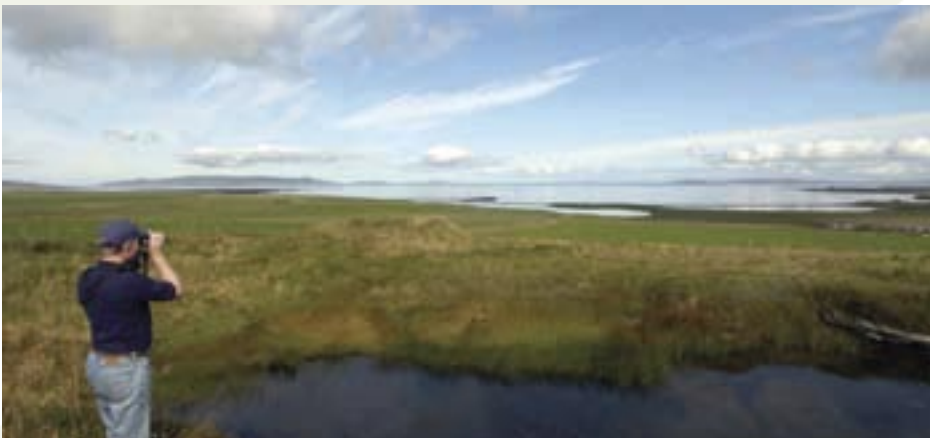
paul hollinrake, shapinsay - charles tait

Interesting features of the island are its storm beaches or as they are known locally 'ayres' a name rooted in the Old Norse meaning a strip of sea water completely shut off from the ocean by narrow necks of land. Look for these at Vasa Loch, Lairu Water and for the natural process near completion at the Ouse.