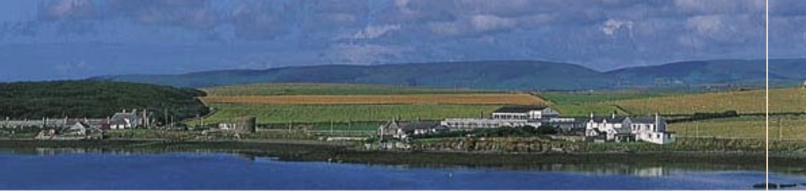
elwick bay, shapinsay - charles tait