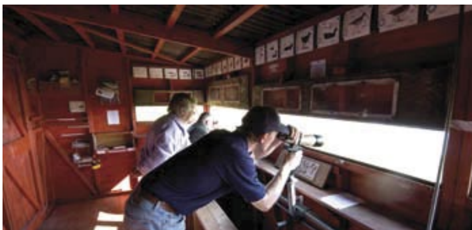
milldam RSPB hide - charles tait

In spite of considerable cultivation in summer Shapinsay's verges and waysides are carpeted with wild flowers.