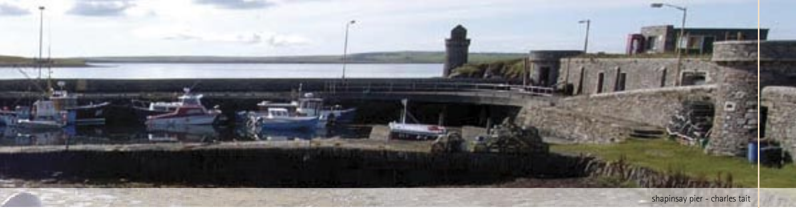
shapinsay pier - charles tait