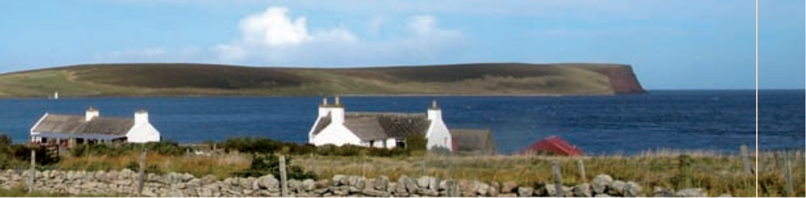
calfsound, eday- charles tait