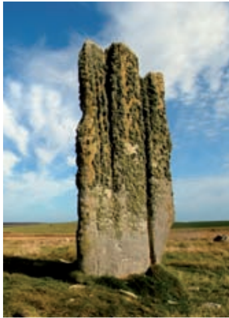
stone of setter - charles tait