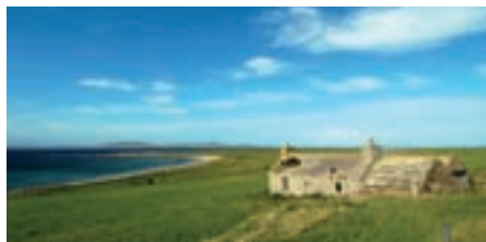
eday - charles tait