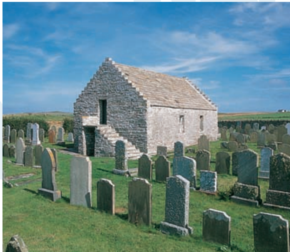
st boniface kirk - charles tait

One of the farm workers' bothies has been converted into a compact museum displaying a fascinating range of artifacts from the island's history including the parish handcuffs!