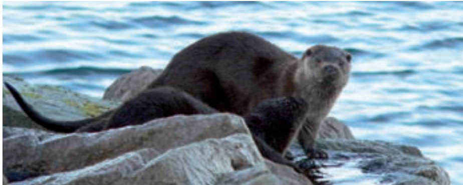
otters - roderick thorne

Sunday Arts Festival - Sept. See local notices.