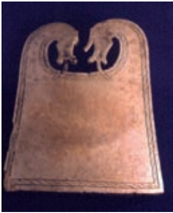
scar plaque - orkney museums and archive