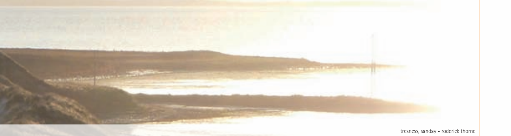
tresness, sanday - roderick thorne