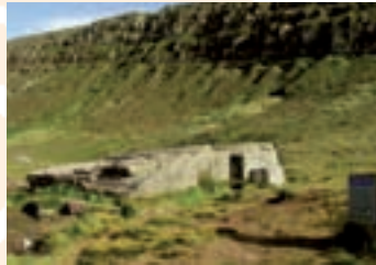
dwarfie stane on the road rackwick - raymond parks

The RSPB Hoy reserve comprises almost 4,000 hectares of moorland with scattered lochans, woodland and huge seacliffs. The reserve is important for a wide range of birds, including hen harriers, peregrine falcons, red-throated divers, waders and seabirds. Hoy holds around 12% of the World's breeding great skua population and you can see fulmars, puffins, guillemots, razorbills, shags and kittiwakes around the Old Man of Hoy in the summer months.