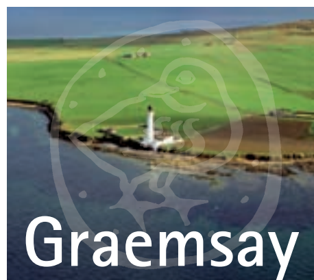
hoy high lighthouse, graemsay - charles tait

St Columba's, Longhope - Church of Scotland. All denominations welcome. Services advertised locally.