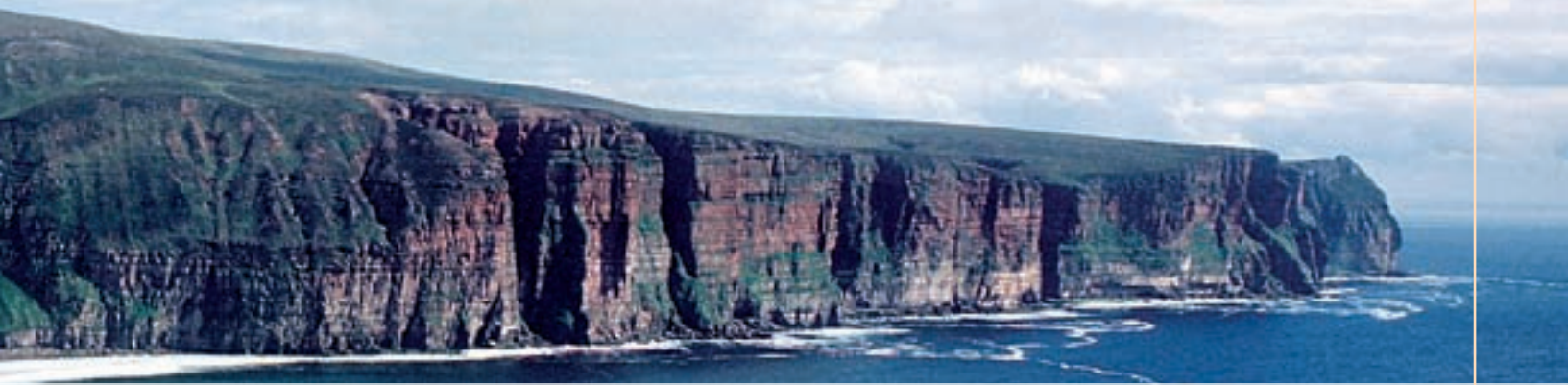
rackwick, hoy