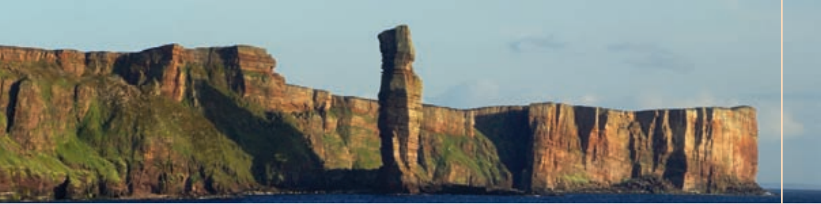
west face of hoy - drew kennedy

13 Lyness Naval Cemetery: Here rest the heroes from some of the most famous incidents in modern naval history – the Battle of Jutland (1916); HMS Hampshire sunk by a mine off Birsay (1916); explosion of the Vanguard off Flotta (1917) and the Royal Oak torpedoed in Scapa Flow (1939).