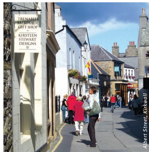
Albert Street, Kirkwall

Orkney offers you the chance to have a real shopping experience. It's blessed with individual, independent shops run by people who really know their stuff, and don't mind spending a bit of time with you to share their knowledge. In the isles, and the further flung mainland parishes, you'll find shops that are social centres as much as retail outlets; a source of information on everything from tides to where to spot puffins. And the studio shops of our artists and craftspeople offer unique opportunities to see these talented individuals at work. Whether it's books or bread you want, butcher meat or brooches, Orkney has real quality and choice in abundance.